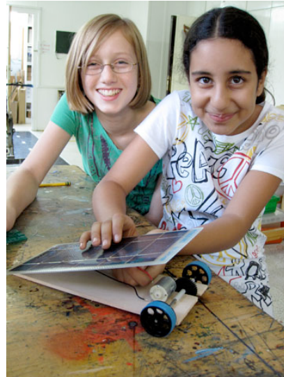
Grade 6 Design Technology Students Assemble Solar Cars