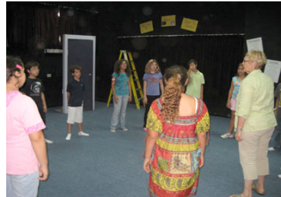
Middle School Performing Arts Classes in Action